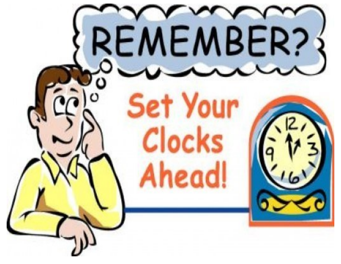
Sunday, March 8